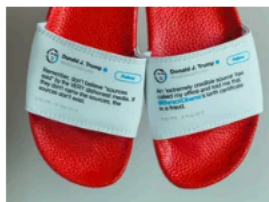
An Artist Turned Trump's Hypocritical Tweets Into Shoes — And Sold Out