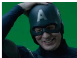
The 'Endgame' Blooper Reel Is An Absolute Riot